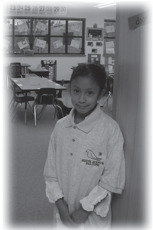
A student shows off a new classroom at Sixth Avenue Elementary.

Community members celebrate the Murphy Creek K-8 grand opening.